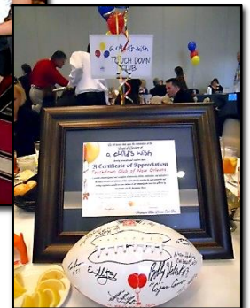
Members of the Club attended “A Child’s Wish” luncheon. “A Child’s Wish” is a Louisiana based non-profit organization fulfilling the dreams of children, helping hundreds of critically-ill children experience the joy of having one of their wishes granted. A certificate of appreciation was presented to the Club.